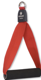
12130 Redcord PowerGrip