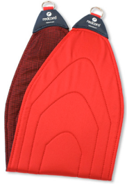
12043 Redcord Wide Sling