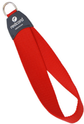
12024 Redcord Strap with ring