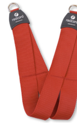
12037 Redcord Split Sling