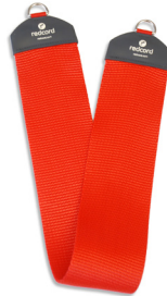
12042 Redcord Narrow Sling